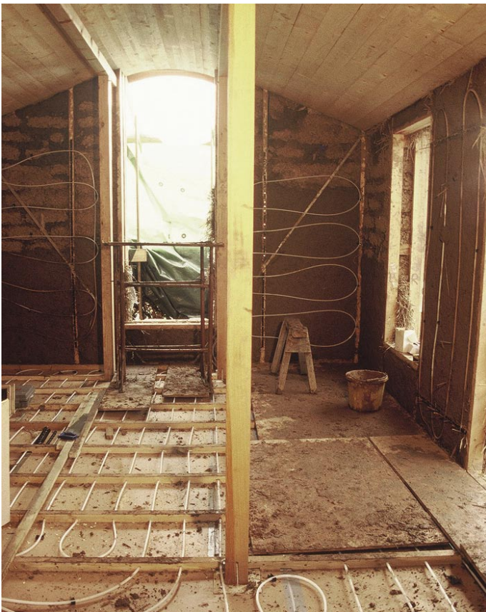
View of a Light Earth building incorporating heating pipes in the floor and walls. This creates a large surface of low level heating which has been monitored and proven successful in creating high levels of comfort. Design: Gaia Architects.

Since we have to maintain fresh air levels at all times ventilation is critical, but in exhausting air for freshness, we are also exhausting heat. Heat exchange ventilators are now common, but it remains the case that by heating the one thing that we need to get rid of, we are to an extent making a rod for our own backs. With warm air heating, lobbies become crucial to stop heat escaping each time we come in or go out, and if windows or trickle vents are left open, we are simply heating the sky. When the building fabric itself is warm and the air is cool, as it should be, such drafts are much less of a worry.