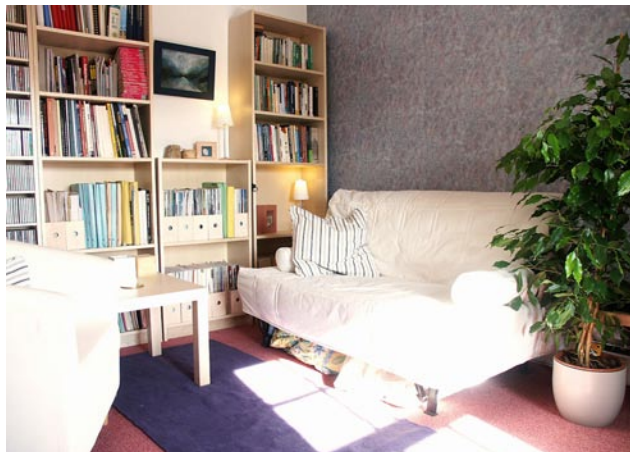
Locate's Office which doubles as a Guest Room through the use of a simple sofa-bed.

on this planet, is vast. Space is what costs - not just to build, but to keep warm, clean and maintain over time. The cost of houses varies hugely, but for a one-off house, with reasonable 'green' credentials, a realistic 'low' construction budget is £750 per square metre (many high spec/ green houses are currently costing over £1000/sqm.) This gives you an idea of what you pay for that extra bedroom.